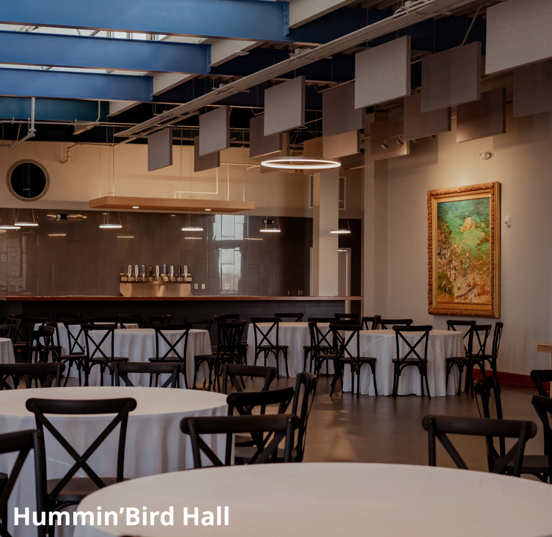
Hummin' Bird Hall